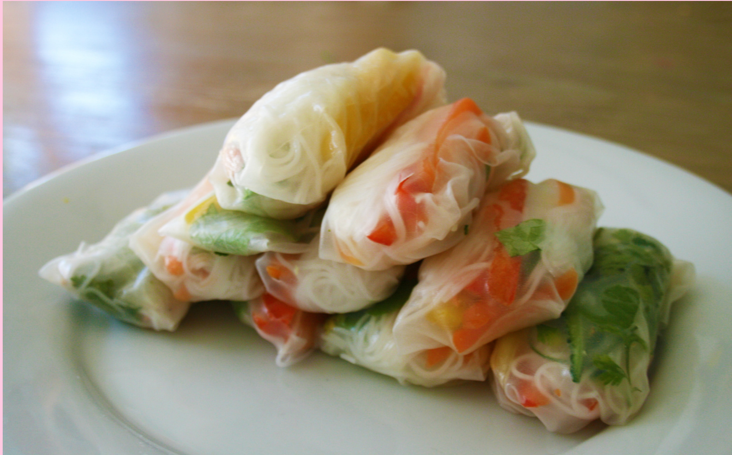
The finished spring rolls.