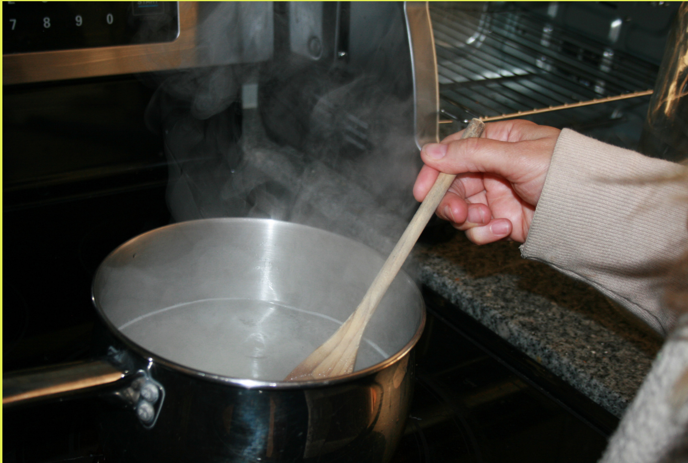
My mom cooking the vermicelli rice noodles.