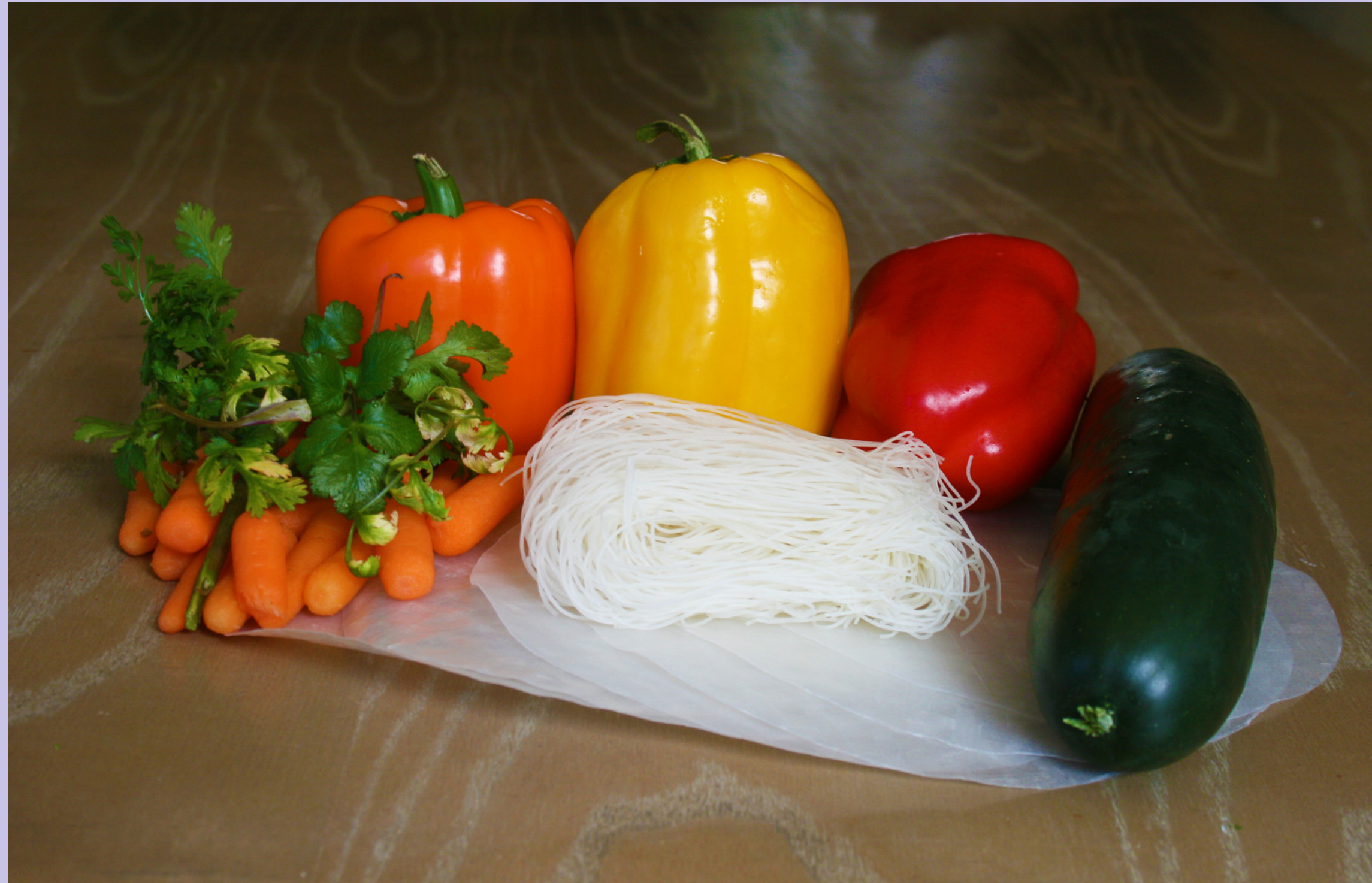
All the ingredients needed to make vegetarian spring rolls.

I recently learned how to make Vietnamese Spring Rolls, and my family wanted to learn how as well. This series of photos shows both my family learning a new recipe together, and the transformation of ingredients to food.