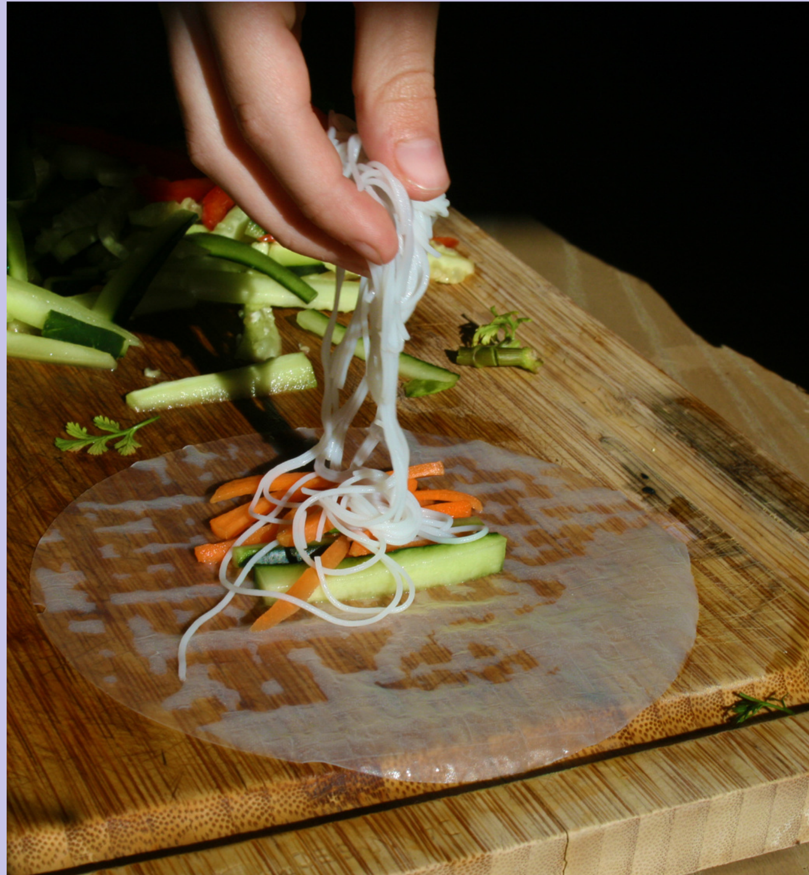
My brother placing the ingredients on the rice paper.