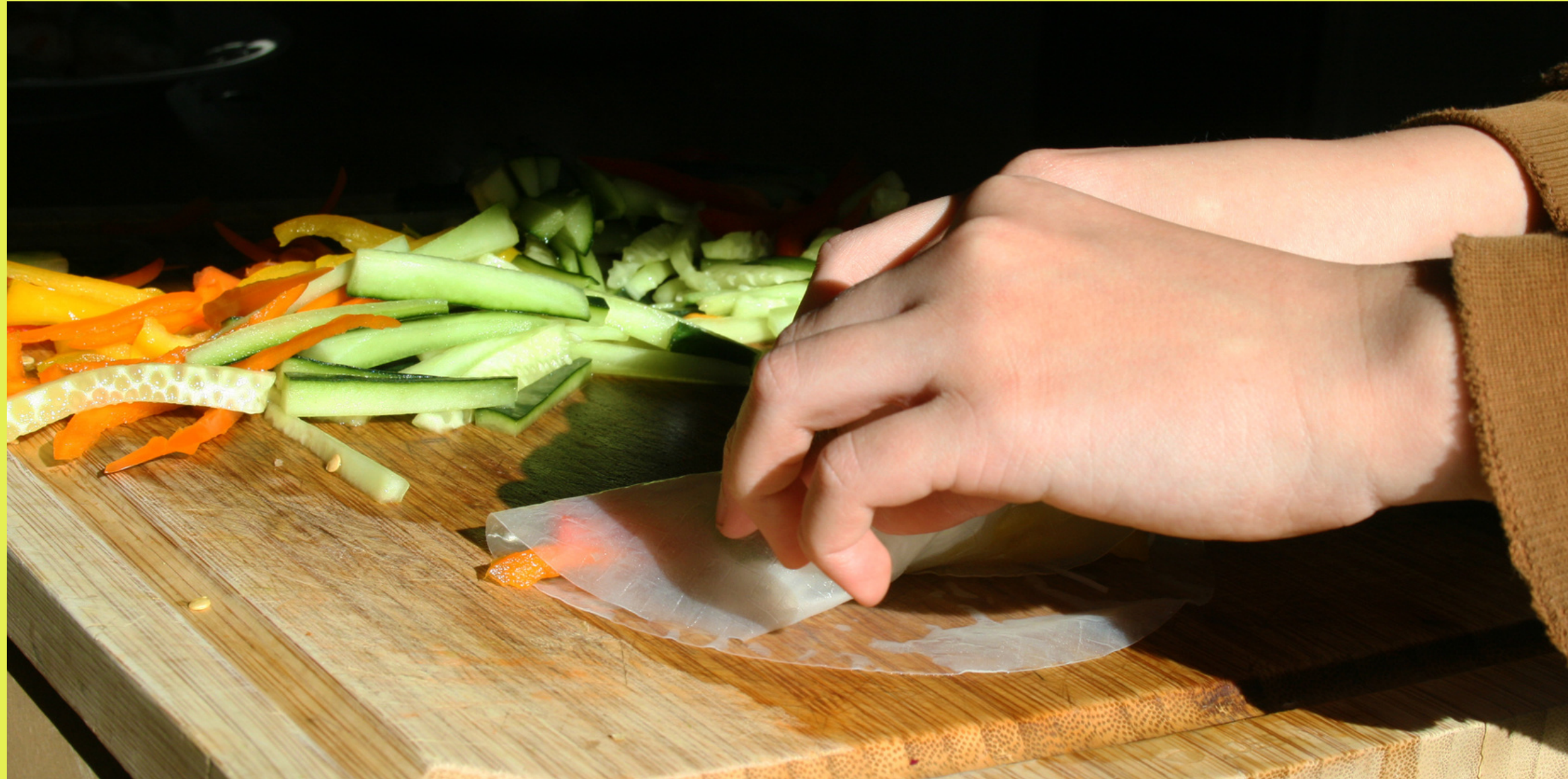
My brother rolling up the spring rolls.