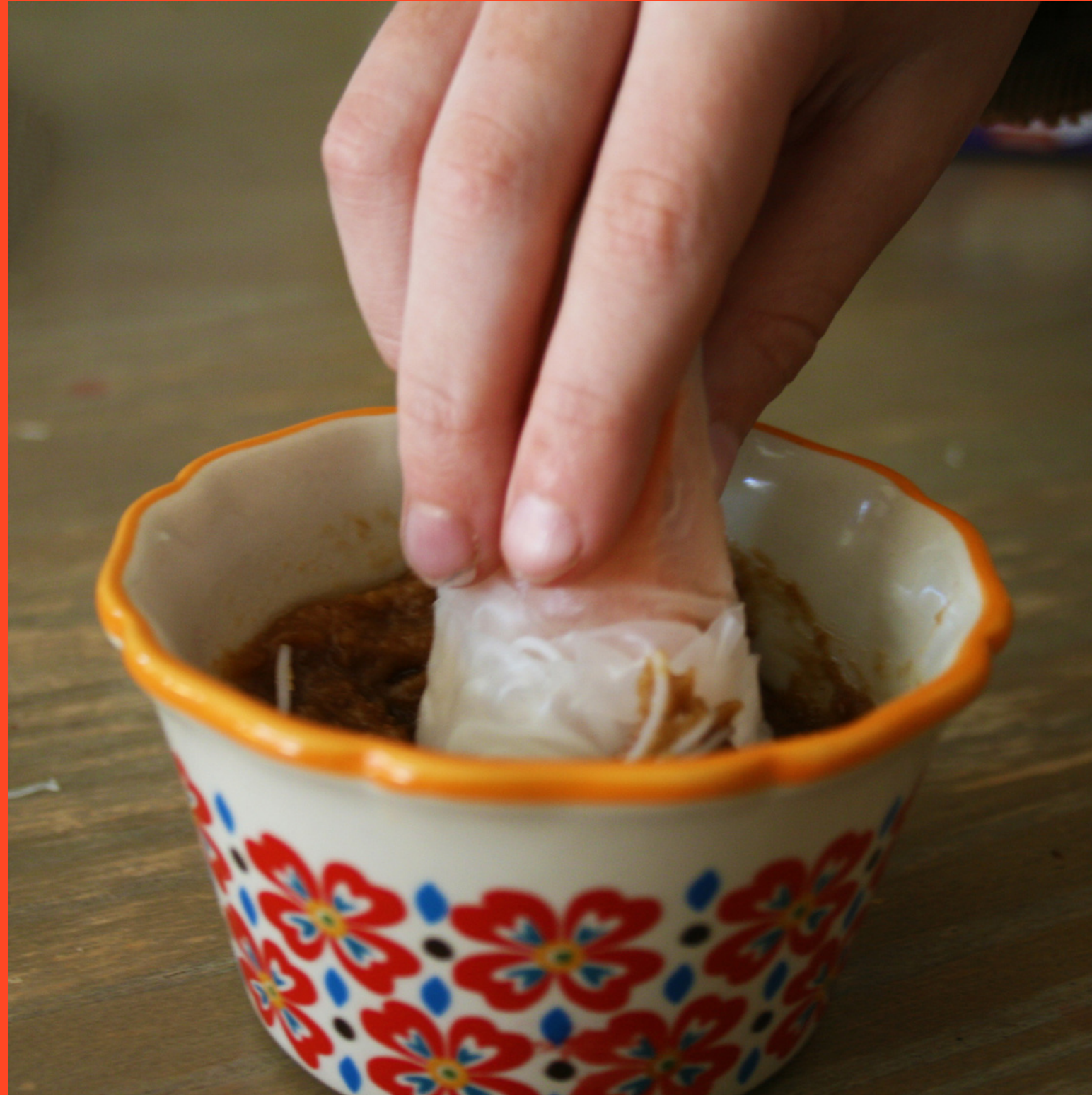
My brother dipping the spring roll in peanut sauce.